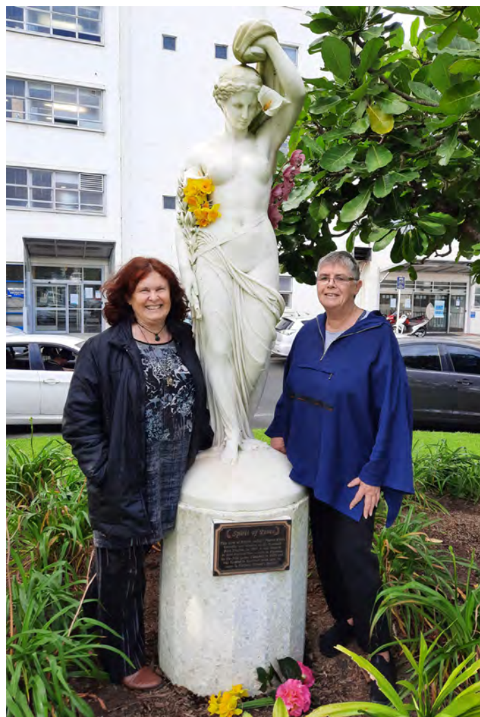
Remembrance: Members of Auckland Women's Health Council at the Spirit of Peace on the 5 th of August 2021.

mainstream media. Unfortunately, her articles have often been put on the back burner by the rise of Covid19 and the timing of lockdowns.